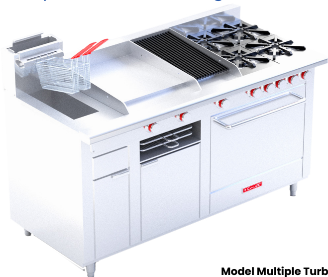
Model Multiple Turbo

The images presented here are illustrative and may vary or not exactly match the physical product.