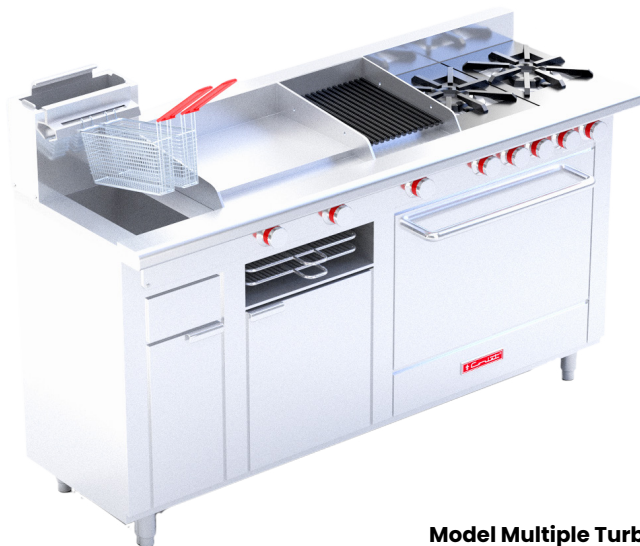
Model Multiple Turbo

The images presented here are illustrative and may vary or not exactly match the physical product.